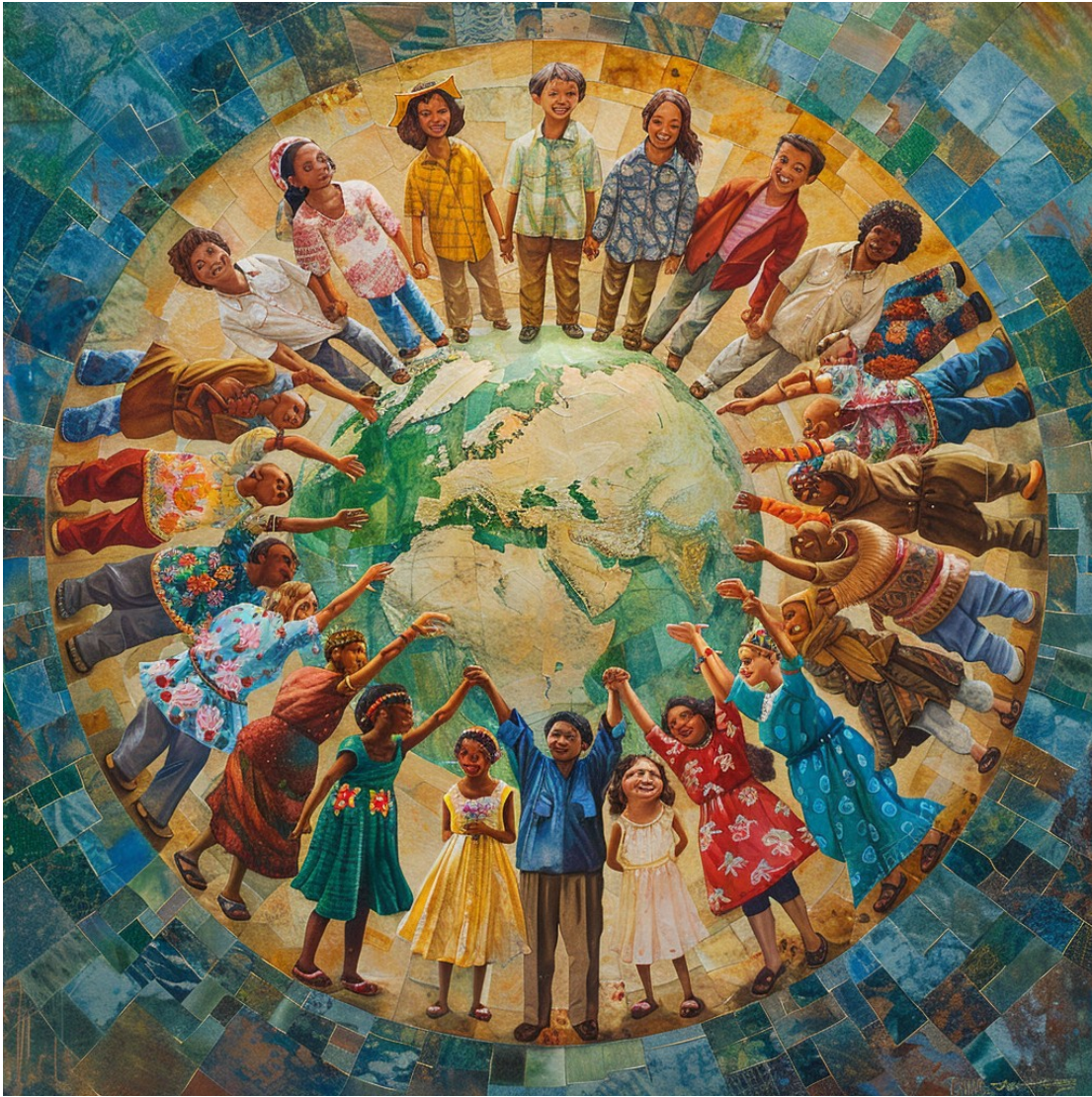
"Global Unity"